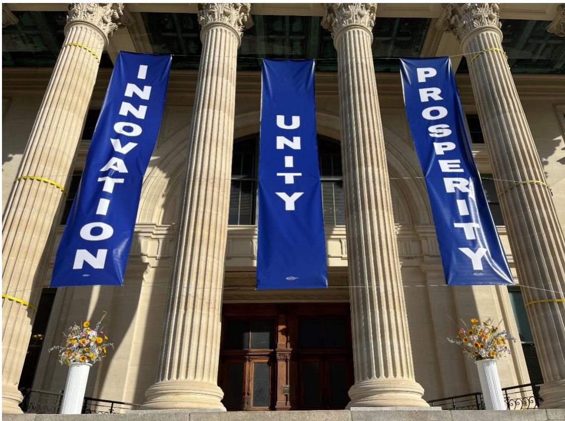
Banners reading "Innovation, Unity, Prosperity" hang on the South portico of the Kansas State Capitol on January 9 th , 2023. These banners flanked Governor Laura Kelly as she was sworn in for her second term.