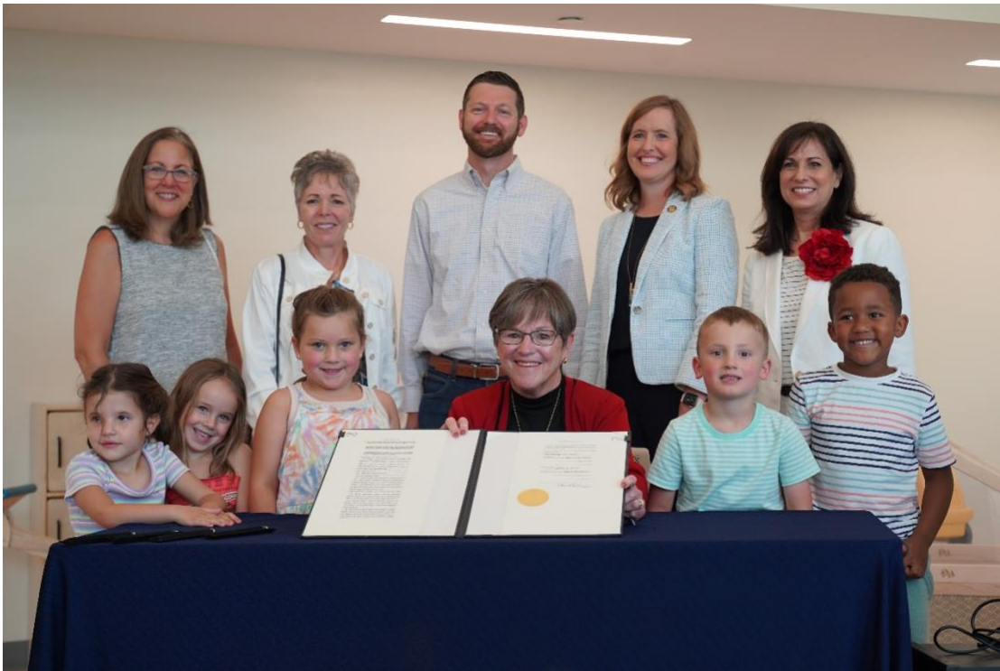
Governor Kelly signing the expansion of the Child Day Care Assistance Tax Credit with council members at Advent Health-Olathe in July 2022.

If Kansas were to make progress in aligning these systems, the Council believes state government can more effectively address the needs of business and streamline processes that expand the availability of services. This action will also be a game changer for the early childhood workforce by creating new career opportunities and maximizing financial support that can expand career options. When all these systems move together, working families will also navigate the system with greater ease.