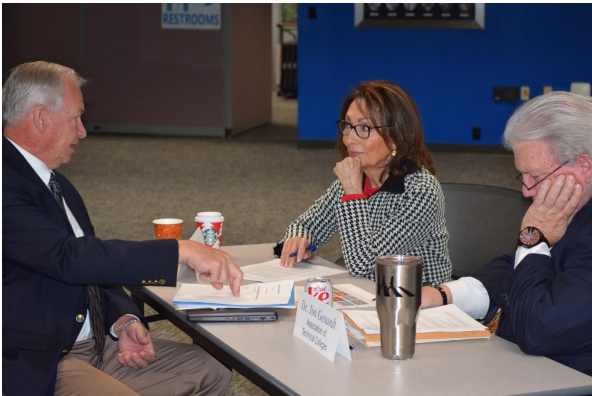
Members of the Council discuss recommendations at the December 9th meeting.

The last four years have proven that Kansas is in an unprecedented era of economic progress and expansion. If we are to meet this moment and keep moving Kansas forward, state efforts need to focus on growing our talent pipeline and preparing Kansans for our rapidly changing economic landscape. New business investment in the fields of technology, cybersecurity, and biomanufacturing require a workforce with an understanding of data analytics and related fields of study. Investing in preparing our teachers to provide expanded instruction in these fields will pay dividends for our state. If we can prepare our future workforce early, Kansas can build upon our previous economic development success by showing that Kansas is open for business and can meet the workforce needs of prospective employers wanting to expand their footprint in Kansas.