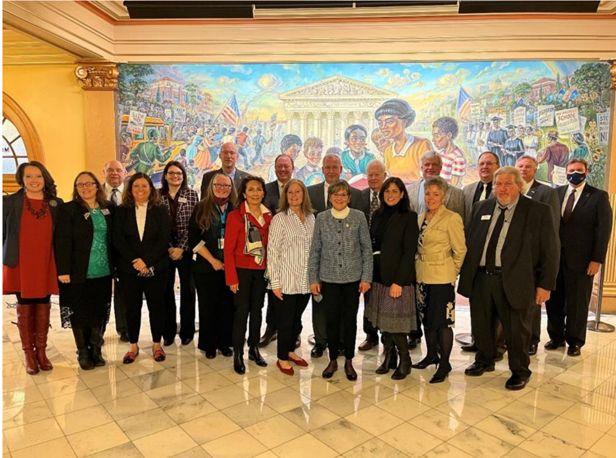
Members of the Council with Governor Laura Kelly at the January meeting.

opportunities for students to receive on-the-job training and experience—setting them up for successful transitions into the workforce.